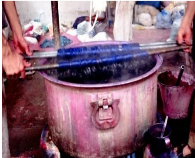
Hank Yarn Dyeing in progress