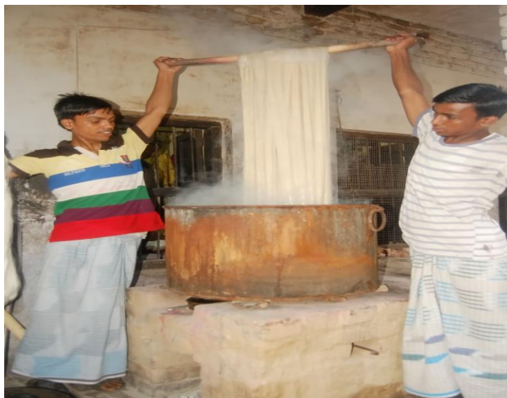
Degumming of Silk yarn

Degumming of silk presents special features because it is usually accompanied by the removal of silk gum or sericin. The process is commonly referred to as “Boiling off”