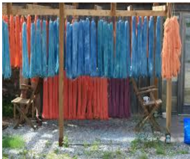
Drying in open air