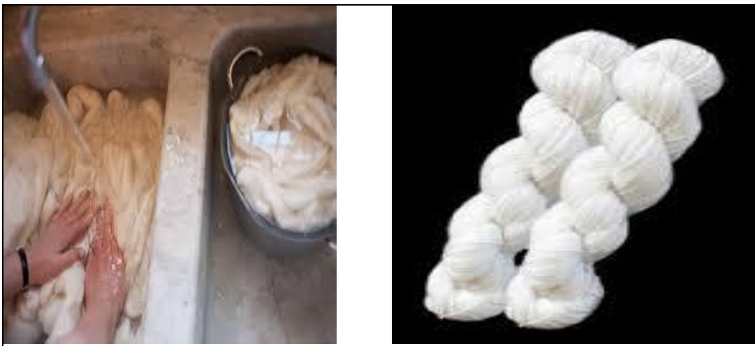
Greige Hank yarn

Bleaching is a process to remove the natural colouring matters and other impurities in cotton Yarn / fabrics to obtain clear whiteness on the textile material as a preparation for dyeing and finishing.