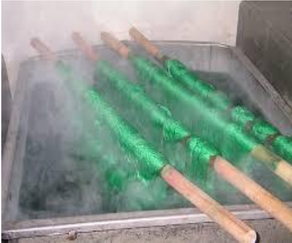
Silk Yarn dyeing