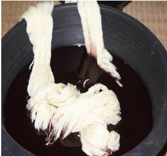
Starting of dyeing operation