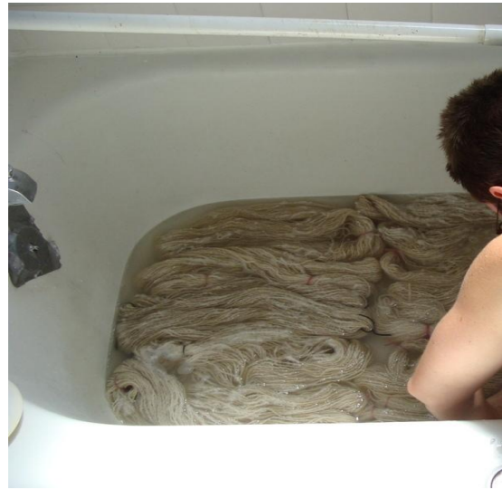
During Pre-Treatment processes